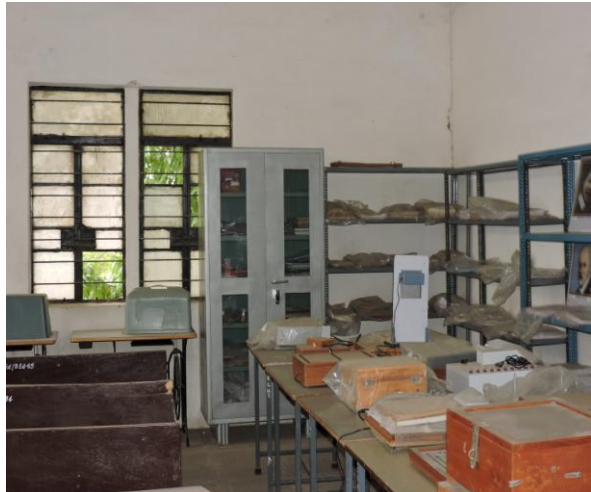
EDUCATIONAL PSYCHOLOGY LABORATORY