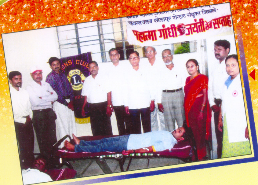
Medical Check-up and Blood Donation- B.Ed. Students