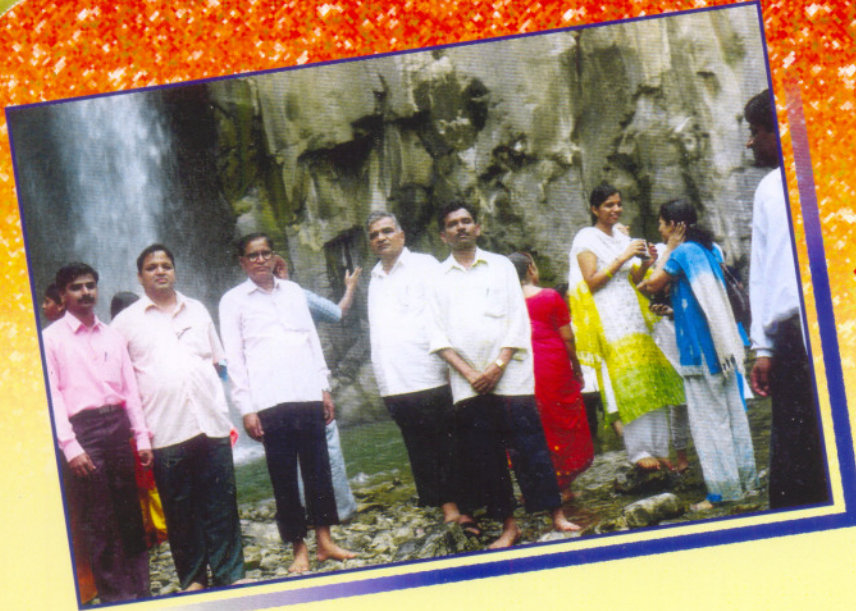
◀ Educational Trip to Ramling, Kapildhara & Kunthalgiri