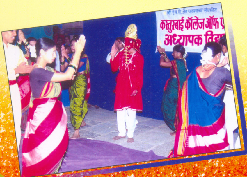
◀ D.Ed. Students - Cultural Activity Programme Social Service Camp 06-07 Panmangrul