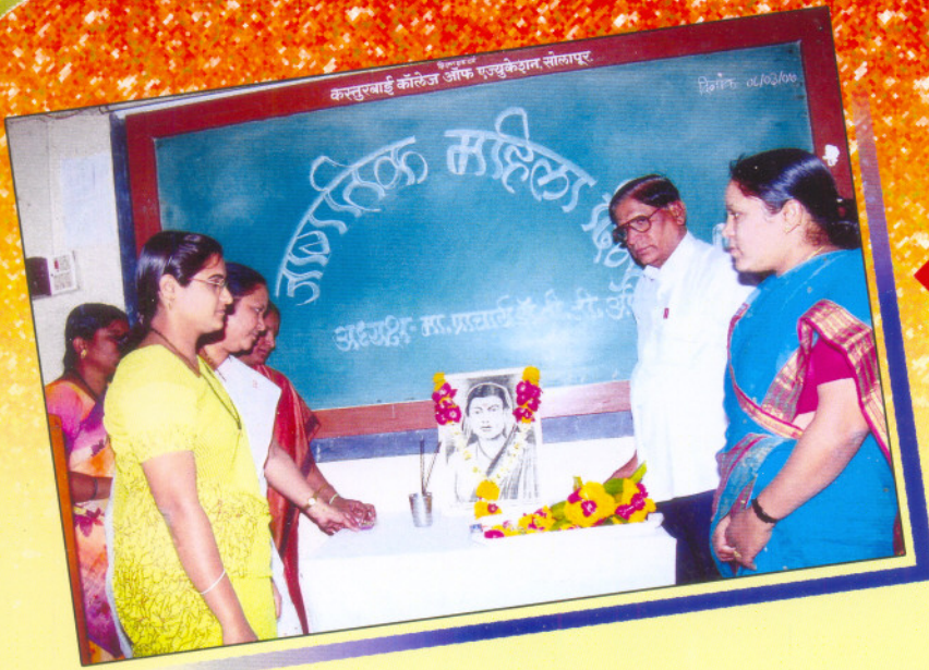
◀ Celebration of "World Woman's Day 06-07"