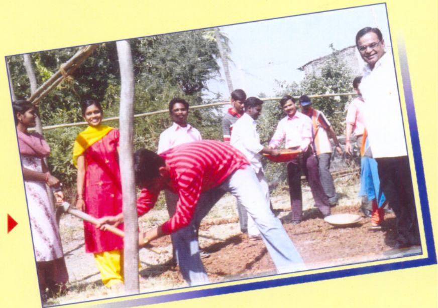
Field work at Social Service Camp 2006 ▶ - Sindphal