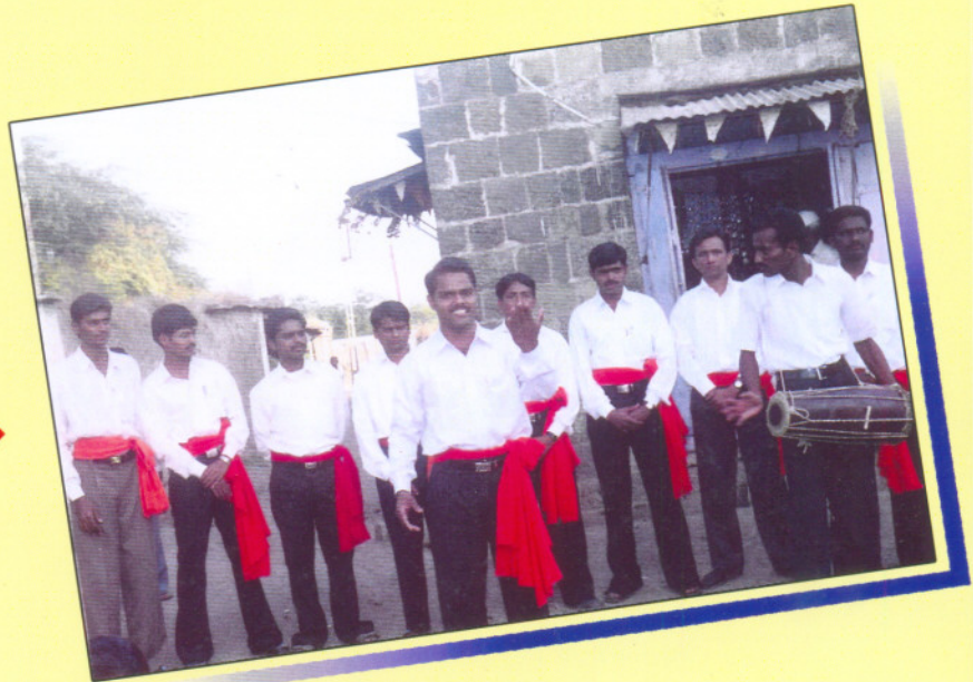
B.Ed. Students - Street Play Social Awareness programed Social Service Camp 06-07 sindphal