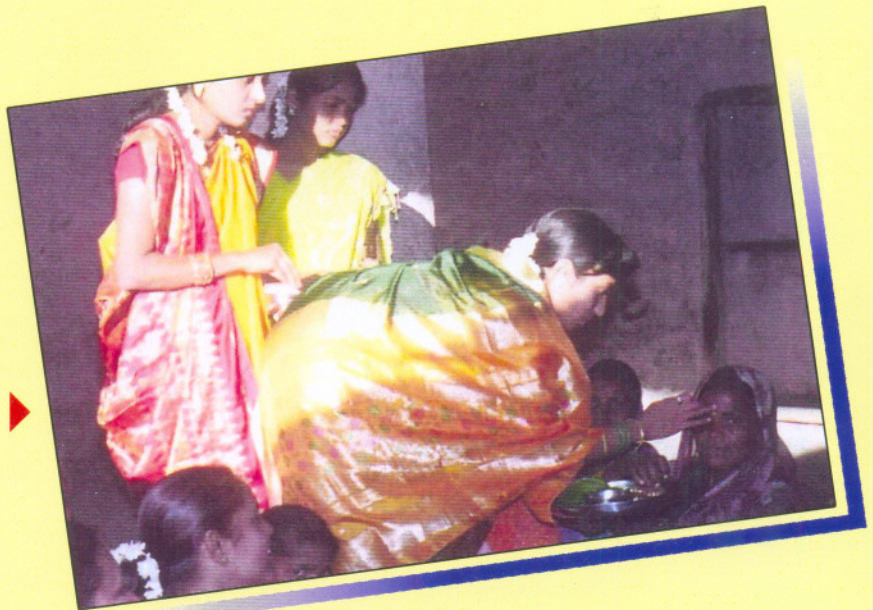
B.Ed. Students- "Haldi Kumkum Function" Social Service Camp 06-07 Sindphal ▶