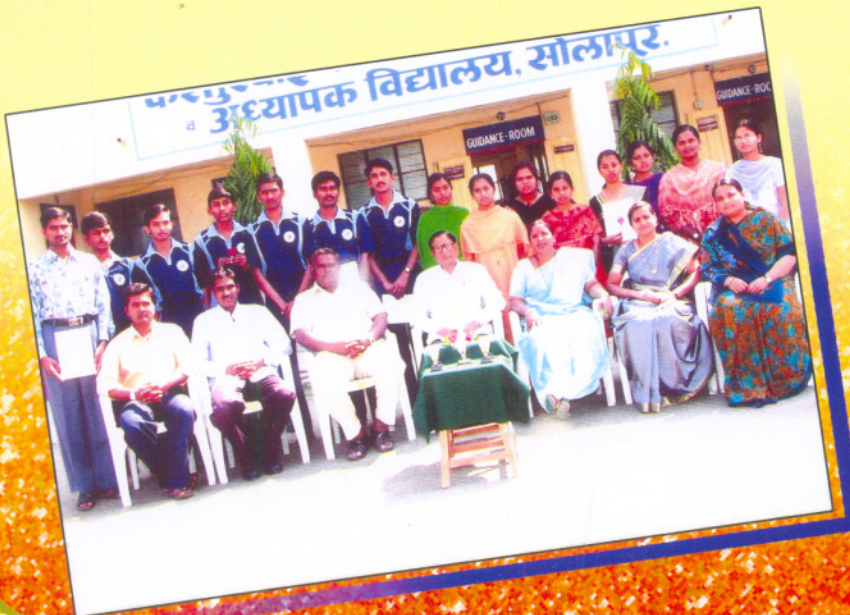
District Sports Competition Winner Students